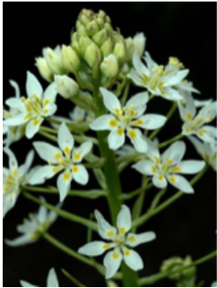
Common Star Lily

If they are not here yet, they are certainly on their way. Splashes of red, white, and blue already abound. Will they look nice in a vase? Unfortunately, no. Many wildflowers wilt quickly, and if picked they are no longer available to seed in the woods for next year. So take photos, not flowers. Here are a few that are already out: